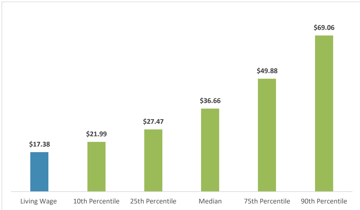
Exhibit 3b – Earnings for Marketing and Distribution in the South Central Coast Region

Source: Family Needs Calculator (Living wage is based on Single Adult households with no children); Economic Modeling Specialists International (EMSI)